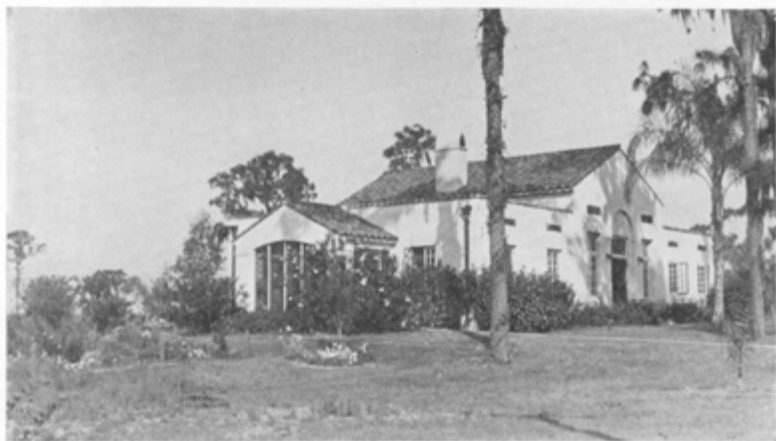
The Library Building on the campus of Webber College at Babson Park, Florida.