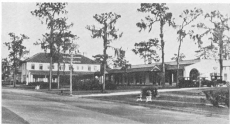
One of the two large dormitories of Webber College of Babson Park Florida.