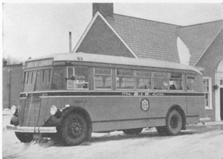
One of the modern buses which are now being used to carry a larger number of people in less time between Boston, Worcester, Springfield, and New York than did the large interurban cars. Future developments of motor coaches will probably make this one look out of date.