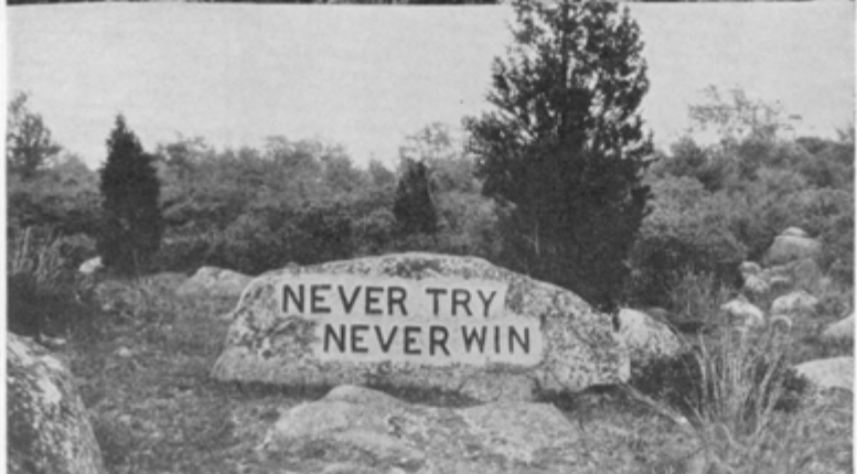
Dogtown Rocks, upon which I am now writing my final and permanent book.