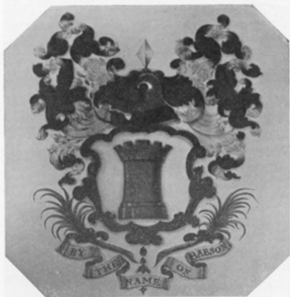
The Babson Coat of Arms, which signifies that the family was always actively engaged in religious and civil struggles.