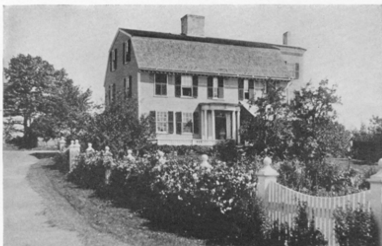
Ancestral Babson home at 245 Washington Street, Gloucester, Massachusetts, where my father and grandfather were born.