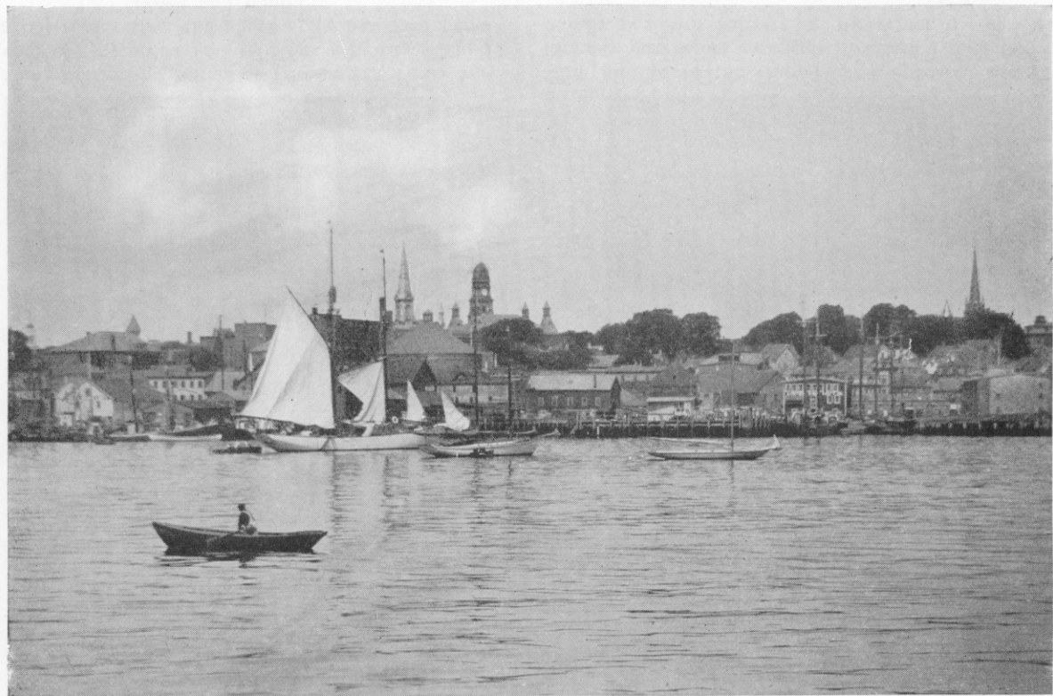
A view of Gloucester proper, showing the section in which I was born and the wharves upon which I played.