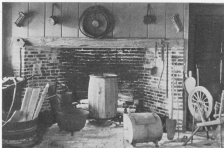
Interior view of above building, showing how it looked when used as a shop for making barrels in which dried fish were shipped to England.