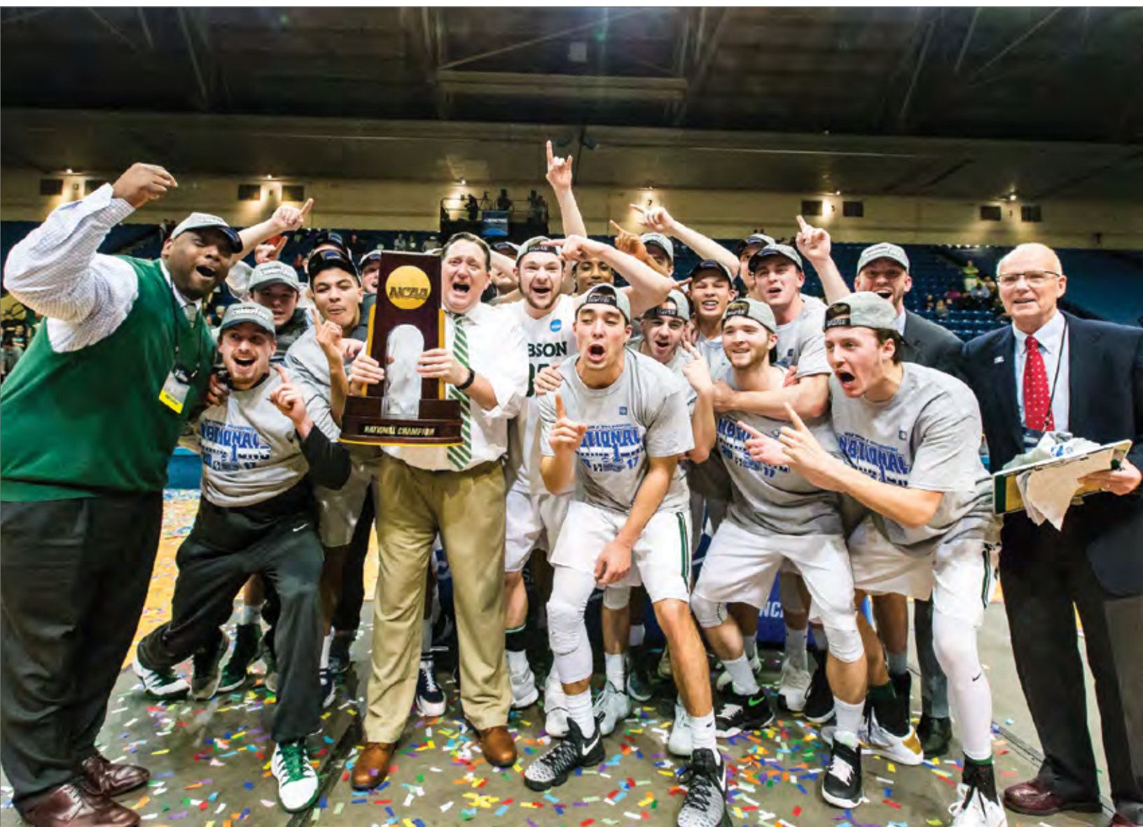
Babson's men's basketball team celebrates its NCAA Division III national championship win over Augustana.

Babson hosts 150 intercollegiate competitions throughout the year that are open to the public for a free or a nominal charge. Check out www.babsonathletics.com for schedules and events.